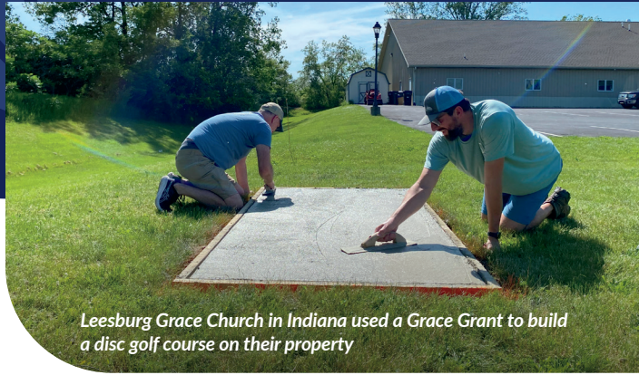
Leesburg Grace Church in Indiana used a Grace Grant to build a disc golf course on their property