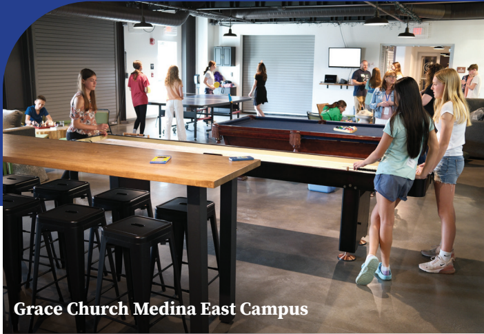
Grace Church Medina East Campus