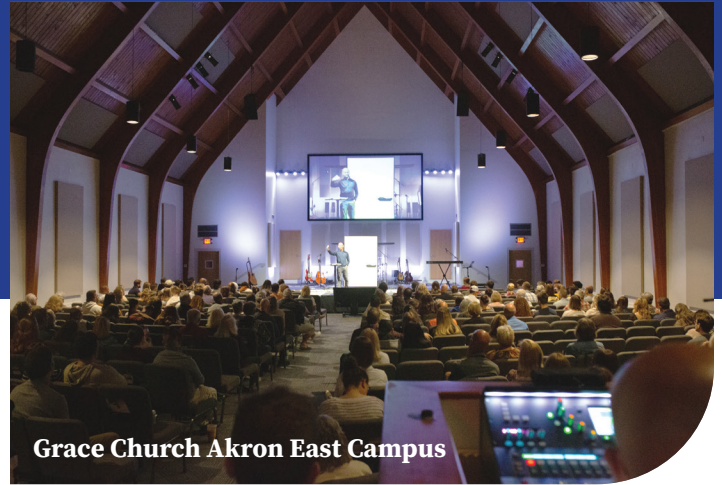
Grace Church Akron East Campus