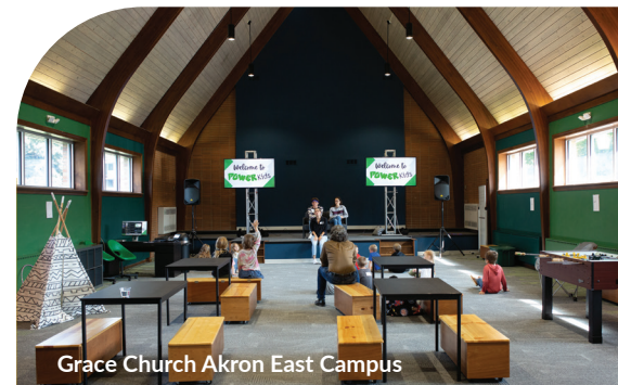
Grace Church Akron East Campus