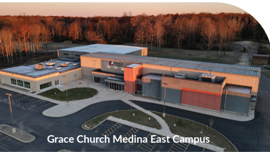
Grace Church Medina East Campus

Today, Grace Church reaches the Akron community through six campuses and has extended its ministry to South Carolina and Georgia. Among these, Akron East and Medina East have recently wrapped up significant expansions to further their ministry to the communities in and around Akron.